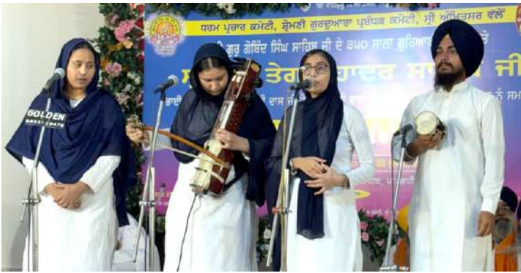
First Position in Vaar Gayan at State level