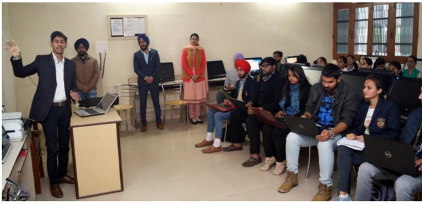
Students of B.Voc Software Development undergoing training session